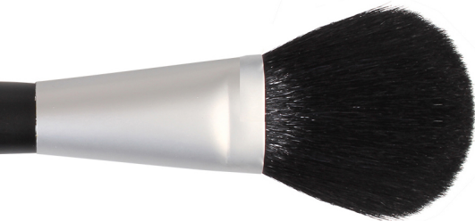
Complexion Brush - £18.00

Soft, long, wide head designed to evenly spread foundation across skin for a flawless application and seamless coverage.